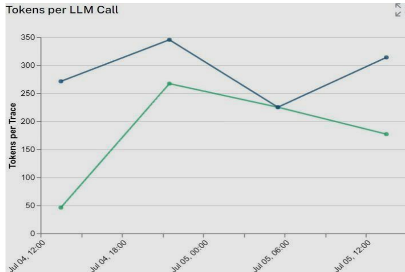
Figure 3: Graph indicating tokens generated per LLM call