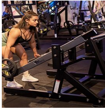
Fig 1: Biomechanics incorporated in the gym.

Accelerometers and gyroscopes installed in these devices, for example, can collect data on acceleration, deceleration, and direction changes, revealing information on the intensity and efficiency of movements like sprinting, jumping, and cutting. Athletes and coaches can improve overall performance by examining force data in real-time or after training/competition. This allows them to discover areas of strength and weakness, refine techniques, and personalize training regimens.